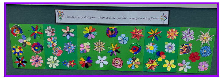
'Friends come in all different shapes and sizes just like a beautiful bunch of flowers'

In Room 3 & 4 we have been learning about how to be a good friend and what makes a good friend. All year we have been working on celebrating our uniqueness and individuality. This relates well to our RE topics and our Mitey topic. During the God strand in RE, we discussed the seasons and God's creations and how beautiful and unique they all are (including us!). In Mitey, we have been learning about our feelings and how to express our feelings to others. We realise it's important to value others' opinions and their emotions.