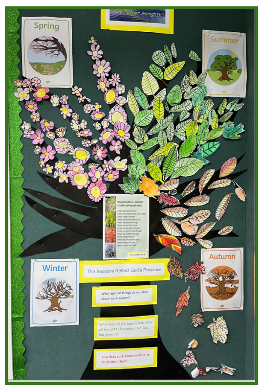
'The seasons reflect God's Presence' - Ecclesiastes 3: 1-8