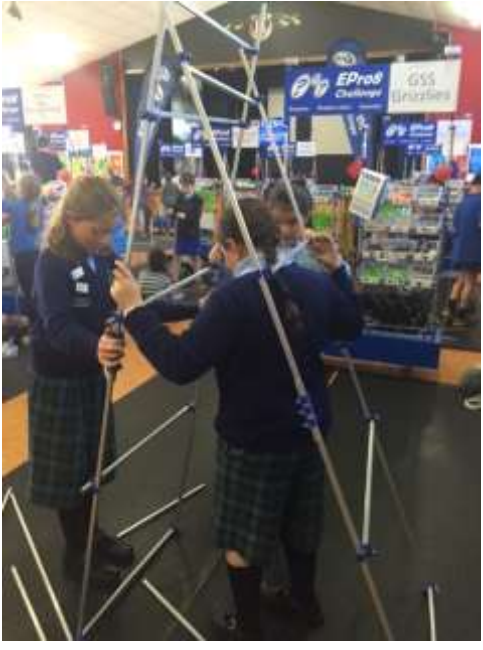
Check out the video from our teams competing at the EPro8 Challenge on our school website <u>www.goodshepherd.school.nz</u>