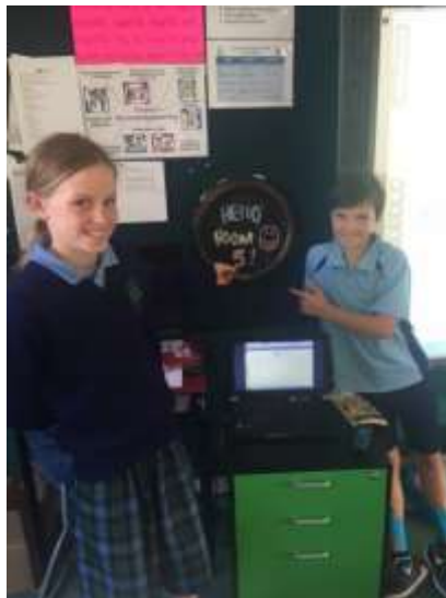
Chalk notice board