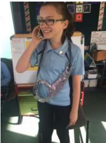
Guitar & toy cellphone