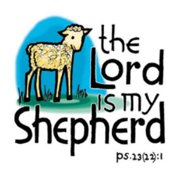
Update Notice, 22 October 2020