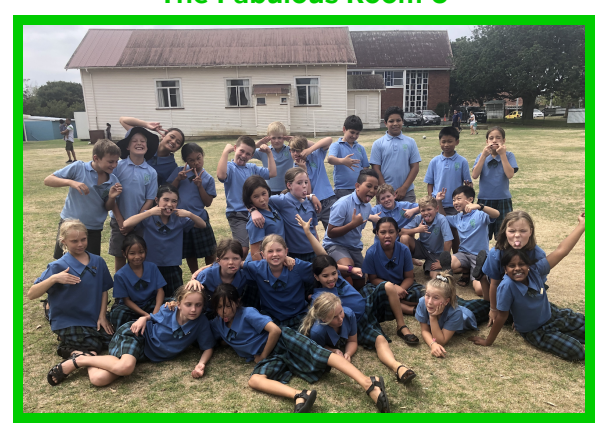
The Fabulous Room 6

During Term One, Room 6 was busy crafting and building their Me Boards with information all about ourselves. The focus was to share who we are with our school community, each individual piece of the puzzle that all contribute to make a fabulous Room 6. Here is our link to our creative Me Boards