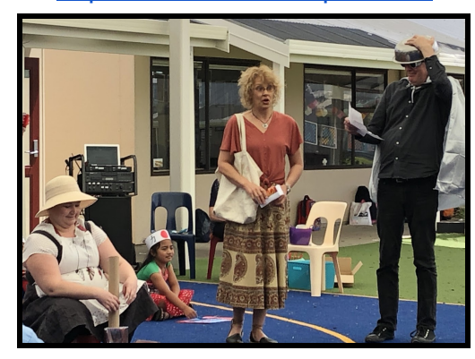
Dare to Explore: Past, Present and Future