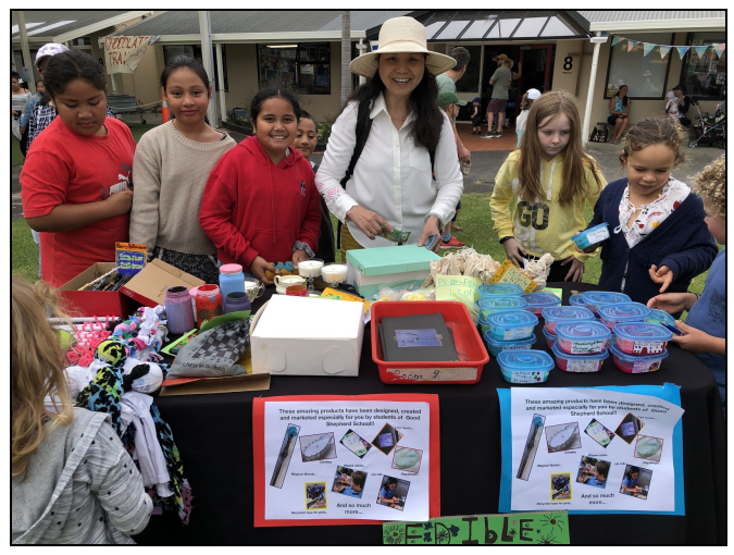
Technology Education in Action