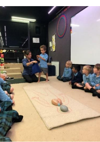
Room 1 & 2 have also been learning about how the Holy Spirit helps them to be what God wants them to be, making good choices. Just like our breath fills a balloon, the Holy Spirit fills us up with love, joy and peace.