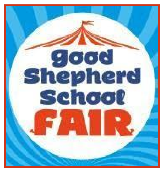
Please join the facebook school fair page by scanning the barcode below or search 'Good Shepherd School Fair 2023'

We would love to thank everyone who came along to the parents, toddler and coffee morning last week. It was a huge success and delightful to see all our young tamariki together. Our next morning tea will be on Friday 13 October.