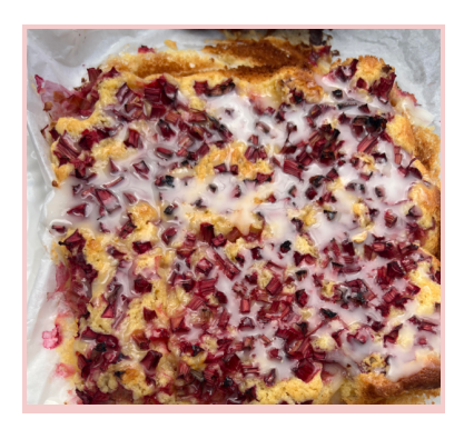
Yummy Lemon & Rhubarb cake. Find the recipe here:

https://mojewypieki.com/en/recipe/lemon-and-rhub arb-cake