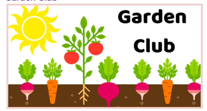
This week at Garden Club we made a lemon and rhubarb cake using rhubarb from our garden and lemon from the Good Shepherd School orchard. The children enjoyed their lemon and rhubarb cake very much.