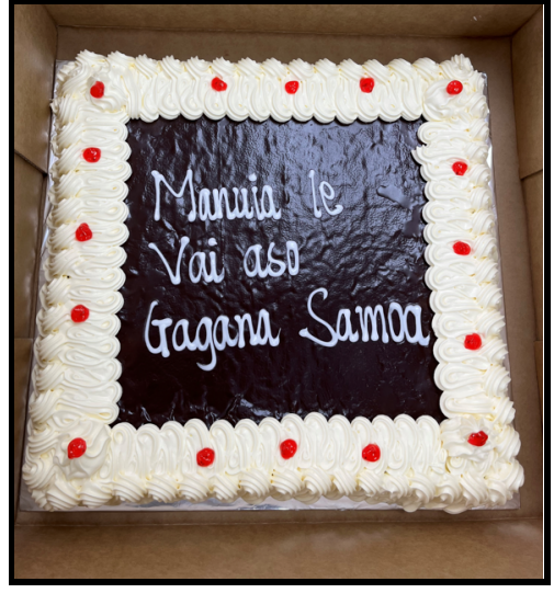
Amazing cake provided from the Siave aiga for Room 3/4.