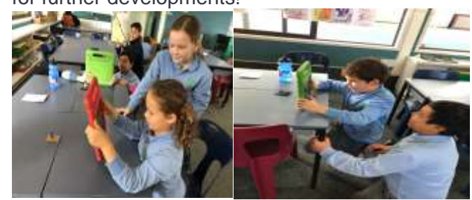
Digital Technology ('Stop Motion')

We had a wonderful start on Monday, to this exciting learning time where children can develop their learning in areas of interest. Watch this space for further developments!